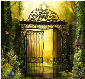
2025 Graduate Certificate – Finding Ourselves in Fairytales: A Narrative Psychological Approach