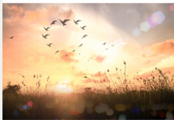
March 2025 Psychology, Religion, and Consciousness Admissions Webinar