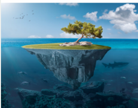
The Complexity of Trauma: Jungian and Psychoanalytic Approaches to the Treatment of Trauma